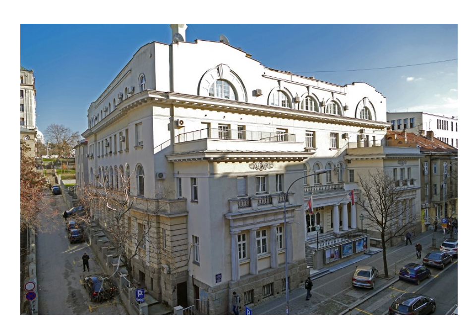
21 July Russian Center of Science and Culture Address: Kraljice Natalije 33, Belgrade, https://goo.gl/maps/aZAbGhvskd6kBob18

The Russian Center for Science and Culture (RCSC) in Belgrade is the representative office in the Republic of Serbia of the Federal Agency ROSSOTRUDNICHESTVO. The RCSC sees its main task as strengthening friendly, cultural, interethnic ties between the two fraternal countries - Russia and Serbia. Being the oldest Russian cultural center abroad, having a unique history and rich accumulated experience, the Russian House in Belgrade has been and is the focus of the spiritual life of the Russian community. The Serbian public also traditionally shows interest in Russian culture, history, language, and treats the cultural and educational activities of the RCSC with great attention and participation.